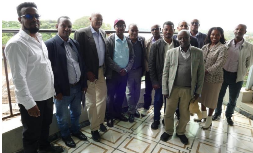
Participants of the first Lake Tana Alliance board meeting, 28th June 2024

The MSP process will lead to the establishment of the Lake Tana Alliance (LTA) as an independent institution to support and facilitate the conservation and development related activities of the Lake Tana Biosphere Reserve. Upon completion of the required documents, The FDRE Authority for Civic Society Organization (ACSO) representative in the Amhara region will register the LTA. According to ACSO's guidelines, LTA governance structure will consist of a general assembly, board, auditors, and a manager with staff. The general assembly includes founders, board members, working group members, and honorary members.