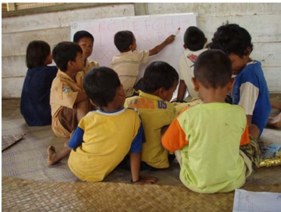
Mobile school for the indigenous community

Of course, there is much more work going on with the local communities besides reforestation activities. To deal with the range of activities, the Community Partnerships department at “Harapan Rainforest” has recently been expanded from three to ten staff members, including three school teachers and four community facilitators who will live in the community.