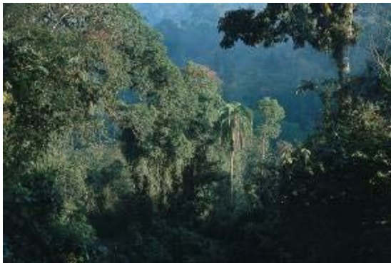
Cloud forest in southwest Ethiopia

In cooperation with the Ethiopian government and partners, NABU has been working towards the preservation and the sustainable management of the remaining afromontane cloud forests in Ethiopia. The four year NABU-Project (2009-2013) “Climate Protection and Preservation of Primary Forest – A Management Model using the Wild Coffee Forests in Ethiopia as an Example” is intended to serve internationally as a model where climate and natural resources protection go hand in hand with sustainable regional development.