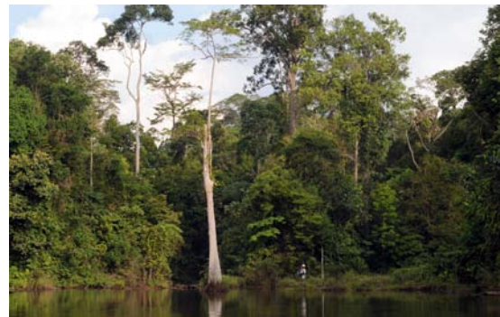
Rainforest of Hope

In the “Harapan Rainforest“ project (Rainforest of Hope), NABU supports the protection and restoration of 98,000 hectares of dry lowland rainforest on the Indonesian island of Sumatra. It is the first project which implements the new Indonesian law on ecosystem restoration. The new license binds concession holders to manage the forest for ecosystem restoration and protect it from deforestation for up to 100 years.